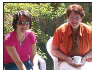
Imagine the isolation of not being able to communicate verbally, especially if you're in a foreign country!

When my husband and I left the U.S. to answer God's call to join a church-planting team in Alkmaar, Holland, I assumed that I was giving up my 23-year career working with the deaf as a sign-language interpreter. Strangely, though, I was amazingly at peace about it.